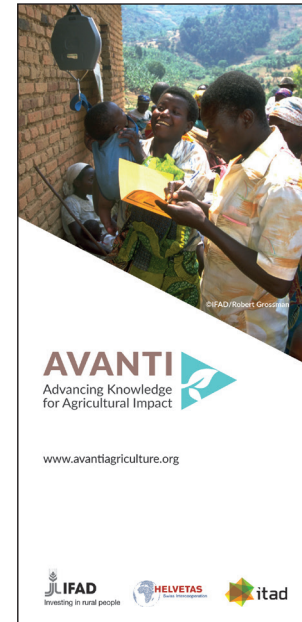
Example of leaflet design. Cover and inside spread

abcdefghijklmnopqrstuvwxy ABCDEFGHIJKLMNPNPQRSTUVWXYZ